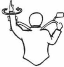
Start your engines