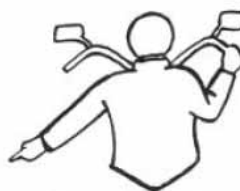
Hazards on the road