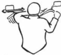
Stop your engines