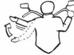
Go ahead and pass me