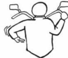
Time for a pit stop