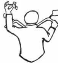
Turn off your turn signals